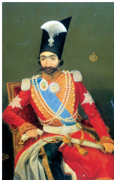
▲ Nasir al-Din was killed by one of al-Afghani's followers a few years after the boycott.

Battle over Tobacco Tension arose between the often corrupt rulers, who wanted to sell concessions to Europeans, and the people. The people were often backed by religious leaders who feared change or disliked Western influence in their nation. In 1890, Persian ruler Nasir al-Din sold a concession to a British company to export Persian tobacco. This action outraged Jamal al-Din al-Afghani, a leader who supported the modernization of Persia. He helped set up a tobacco boycott by the heavy-smoking Persians. In the following quote, he expresses his contempt for the Persian ruler: